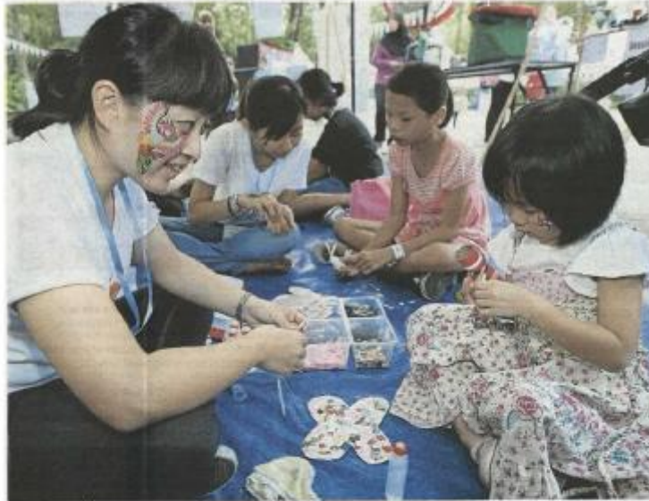
Children are taught to use recycled items to create beautiful artworks at the Recycle Art and Paper-Folding Workshop.