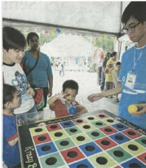
A child trying his hand at the Crazy Ball game.