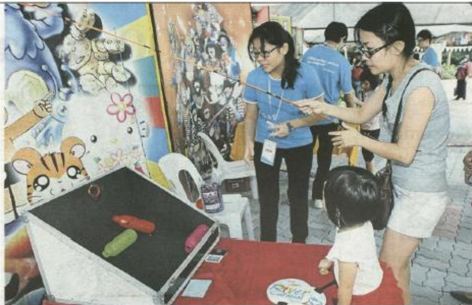
A visitor trying to fish a bottle at the Kids Activity Corner.