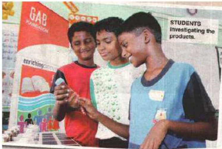
STUDENTS Investigating the products.